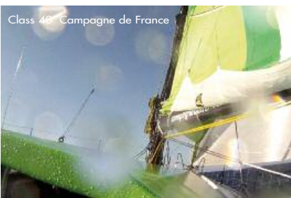
Class 40' Campagne de France