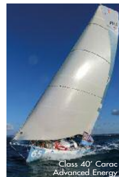
Class 40' Carac Advanced Energy