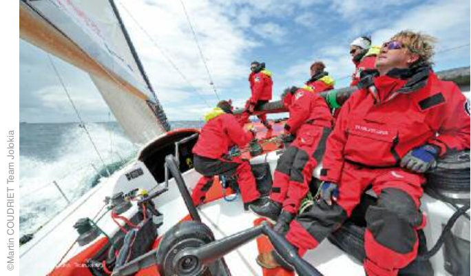
Team Jolokia

Facnor has been supported, throughout its development, by various long term, sport and solidarity projects where sharing experiences and challenges have helped track its course.