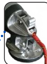
integrated line stopper