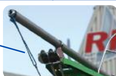
Bridle kit (option)