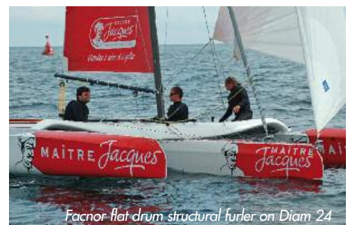
Facnor flat drum structural furler on Diam 24