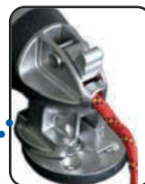
integrated line stopper

■ Integrated line stopper for holding the tackline.