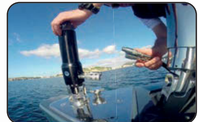
Plugging without oil leak