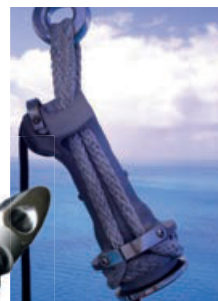
16 tons lock for Maricha III (147') Code zero