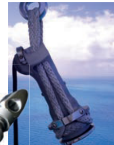
16 tons lock for Maricha III (147') Code zero