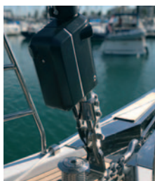
42 → 60' HF500 & 600