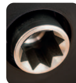
(after use, screw the cap back)

situated on starboard for emergency handling (or the Facnor emergency continuous line system).